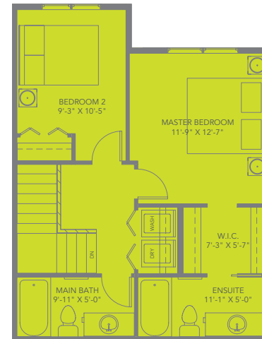
UPPER FLOOR PLAN 2 BEDROOM APPROX. 588 SQ.FT.