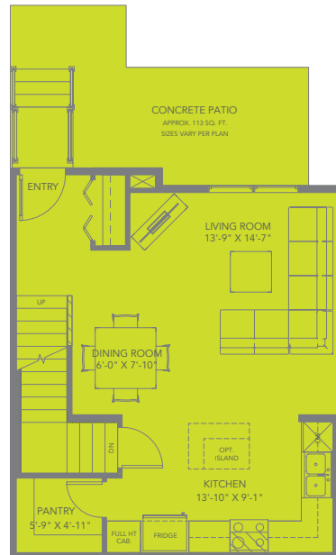
MAIN FLOOR PLAN APPROX. 519 SQ.FT.